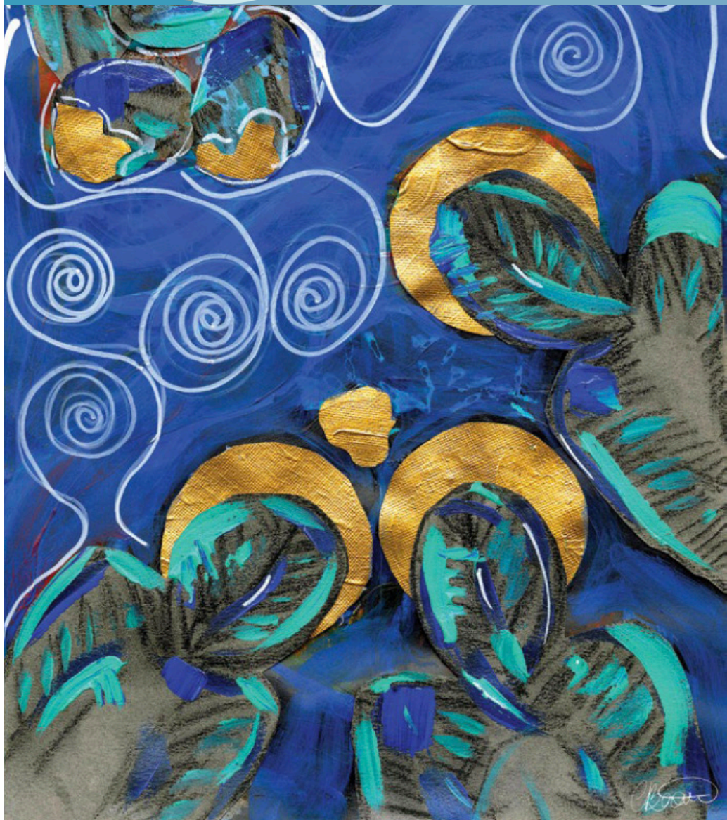
WET STONES by Carmelle Beaugelin